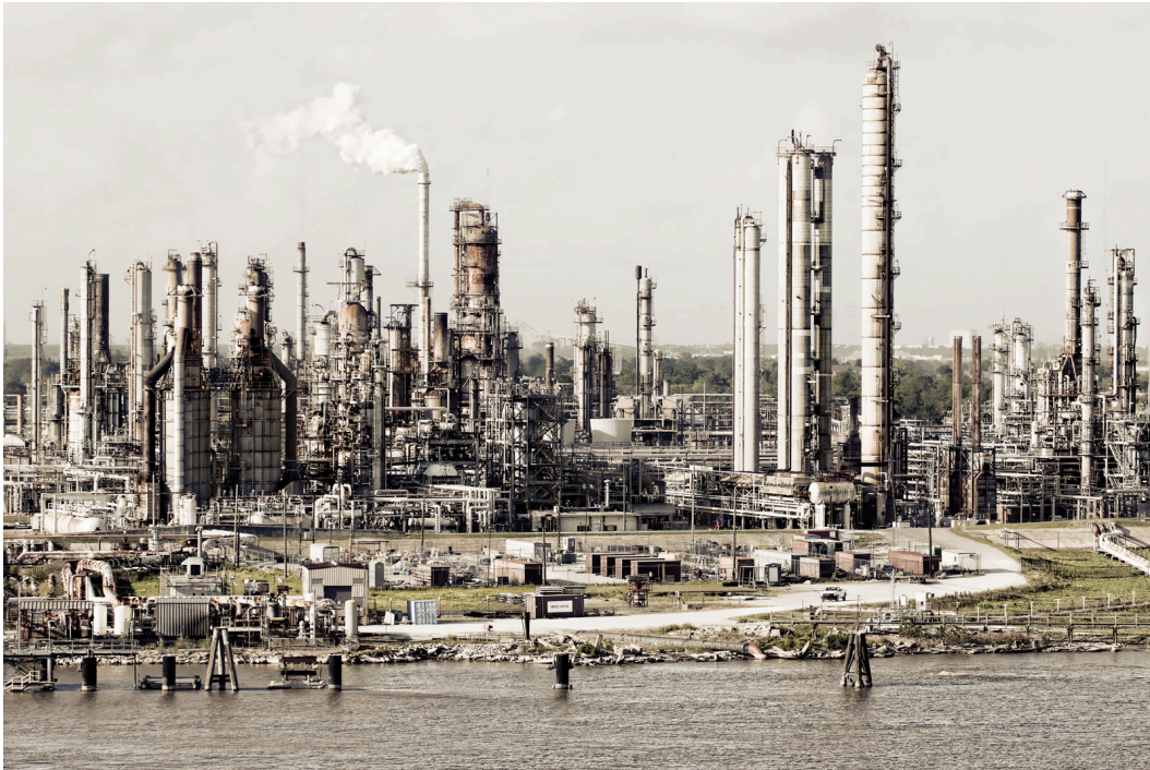
Oil refinery along the Mississippi river between the Port of New Orleans and the river mouth.

What kind of citizens/subjects do such state structures help to shape? How do people constitute themselves? How is the relationship between what I will call ‘petro-state citizens’ and the state characterized? What attributes are in play with each other in this relationship?